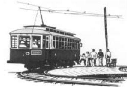
Edmonton Radial Railway Society

E-mail bridgecharter@edmonton-radial-railway.ab.ca for booking availability.